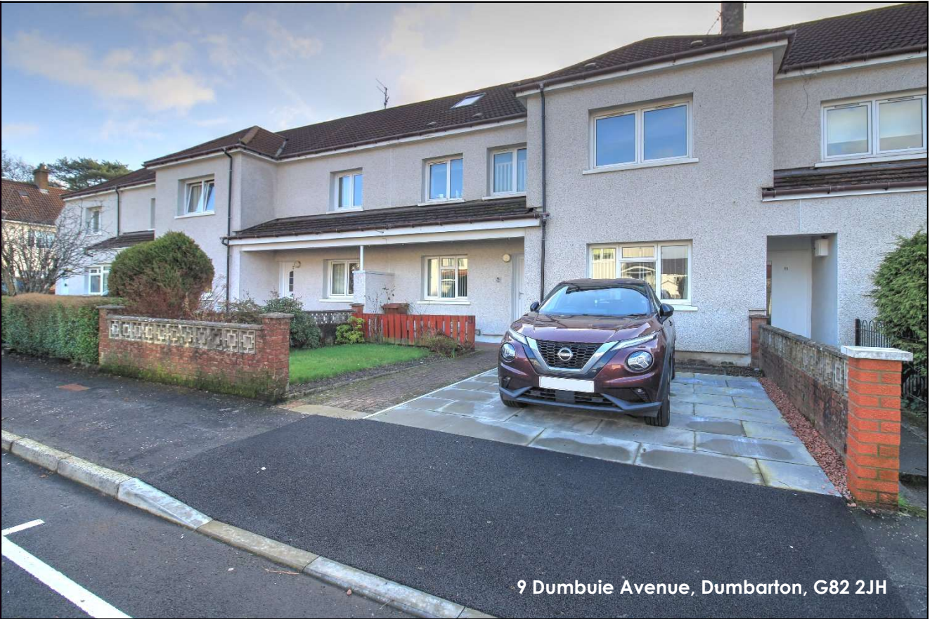
9 Dumbrie Avenue, Dumbarton, G82 2JH

The agents are delighted to present to this market this generously proportioned 2 bedroom ground floor flat. The current owners have carried out a complete refurbishment programme to present this superb home in walk in condition.